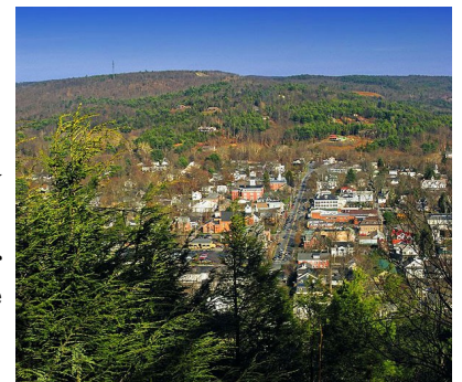
Scenic Milford, PA.

The historic and multi-faceted city of Milford has a lot to offer if you can keep an open mind and are willing to explore. If you ever find yourself in an adventurous mood, you should check it out!