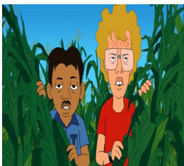
A scene from Fox's "Napoleon Dynamite"