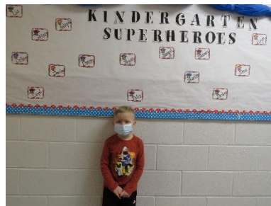
K- Hunter watched Disney on Ice